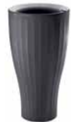
Slate Ref: 97