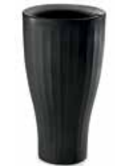
Caviar Black Ref: 94